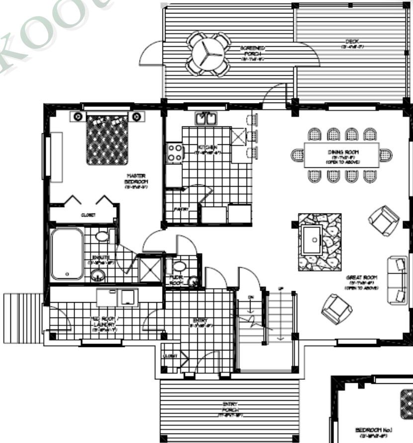
Main Floor 1,300 sq ft